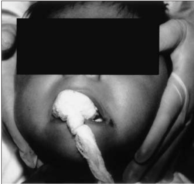
Fig 2. Modified gauze pad in use.