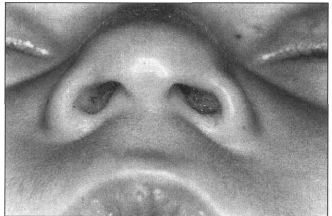
Fig 1. Bilateral cartilaginous nasal valve stenosis.

The patient was able to bottle feed normally with the stents in place. His parents were instructed carefully on care of the appliance prior to discharge. An apnea