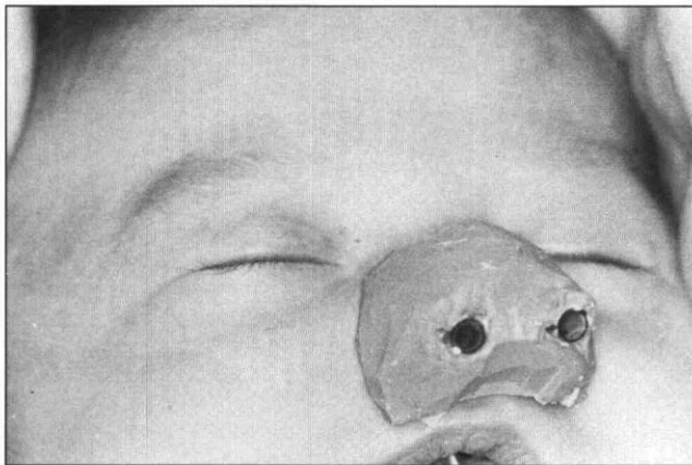
Fig 3. Endotracheal tube stent.

A differential diagnosis of nasal obstruction includes upper respiratory infections, 9 congenital nasal and midface deformities or masses, 2,8,9 a small bony piriform aperture, bilateral choanal atresia, 9 neonatal rhinitis, 3 and cartilaginous nasal valve stenosis. Endoscopic evaluation under general anesthesia is an extension of the physical exam and is indicated in the presence of significant upper airway obstruction of uncertain etiology. In this child, the only observed abnormality was his bilateral cartilaginous nasal valve stenosis. This was relatively easily corrected as described.