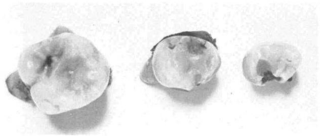
Figure 2. Occlusal view of extracted maxillary right primary second, first and supernumerary first molars (from left to right).