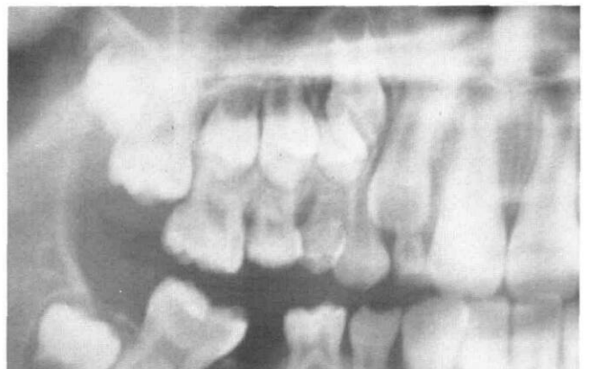
Figure 4. Radiograph showing maxillary right first supernumerary primary molar and supernumerary premolars.

Most primary supernumerary teeth are erupted and asymptomatic when diagnosed; hence, it is likely that many are exfoliated without being discovered. More attention now is being given to prevention and restoration