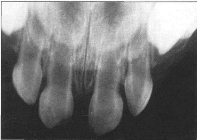
Fig 2. Periapical radiograph of the maxillary primary incisors less than 24 hr after injury. Note the wide pulp chambers, incompletely formed roots, thin dentinal walls, and open apices.

started and continued during the dental procedure. The child's vital signs were monitored during the whole procedure using a pulse oximeter. The child was fully cooperative during the dental procedure with no disruptive behavior. Local anesthesia was achieved by infiltrating 2% lidocaine (1 cc) with epinephrine 1:100,000 and the teeth were isolated with a rubber dam. Partial pulpotomy (Cvek technique) was performed on the right central incisor. A #330 tungsten bur was used to amputate 2 mm of the pulp close to the exposure site. Continuous rinsing of the amputated pulp with sterile saline allowed hemostasis without blood clot formation. Calcium hydroxide paste (Calxyl, Dental preparation. Otto & Co. Frankfurt/Main, Germany) was used as dressing for the pulp, covered by IRM (Bayer—Leverkussen, Germany). The remaining exposed dentin was lined with Dycal (L.D. Caulk, Milford, DE). Both teeth were restored using Vitrebond (#7510 3M Dental Products Division, St. Paul, MN) and Durafill (Kulzer & Co. GmbH, Wehrheim, Germany) (Fig 3).