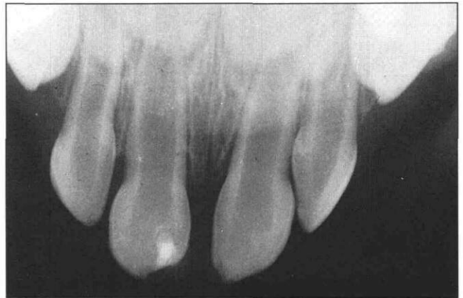
Fig 4. Periapical radiograph of the maxillary primary incisors three months after treatment. Notice the dentinal bridge, width of the dentin walls of the roots and development of both incisors.

discoloration or excessive mobility. The soft tissue adjacent to the traumatized teeth was healthy.