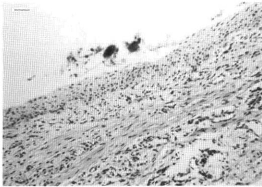
FIG 3. Histopathologic section of residual soft tissue fragments removed from maxillary right permanent lateral incisor (dens invaginatus). The scale bar indicates 20 \mu m.

tum. At the apical end of the tooth, well organized pulpal tissue was visible and, as in normal tooth morphology, it was surrounded by dentin and cementum. These findings confirm the clinical impression of a Type II dens invaginatus.