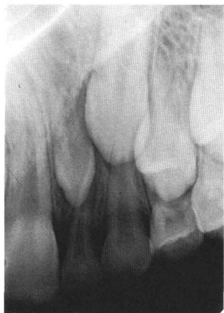
FIG 2. Periapical radiograph of pegged maxillary left permanent lateral incisor.