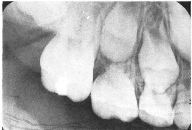
Figure 3. Radiograph of the corrected condition.

During the past two decades many methods for treating this condition (except for that of Croll and Barney 11 ), have been tried with varying degrees of success. The new simple appliance described in this paper is a combination of many previous treatment techniques. It effectively corrects the ectopically erupting permanent molars and promotes a normal eruptive path. Since two springs are utilized, an even force from both the buccal and lingual sides of the tooth is directed at approximately right angles to the long axis of the ectopically erupting first perma-