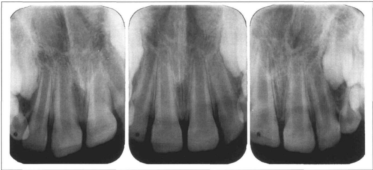
Fig 3. Hypoplasia affecting crowns of developing permanent canines and premolars.

Radiographs indicated horizontal ridging of the crowns of the maxillary right and left central and lateral incisors and enamel hypoplasia of the unerupted permanent canines (Fig 3).