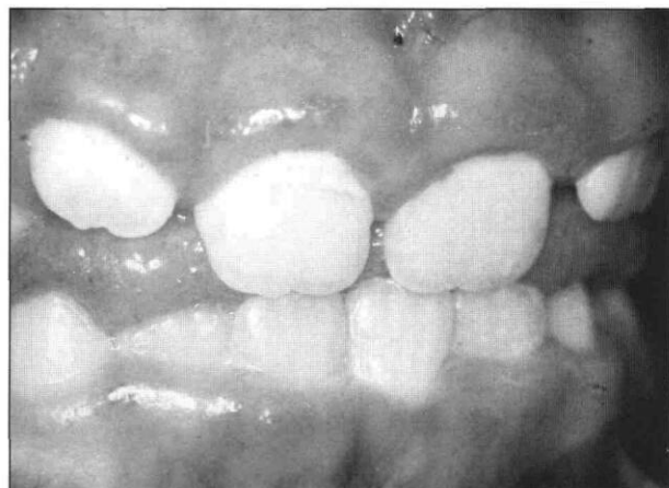
Fig 2. Enamel hypoplasia affecting the crowns of the maxillary permanent incisors.