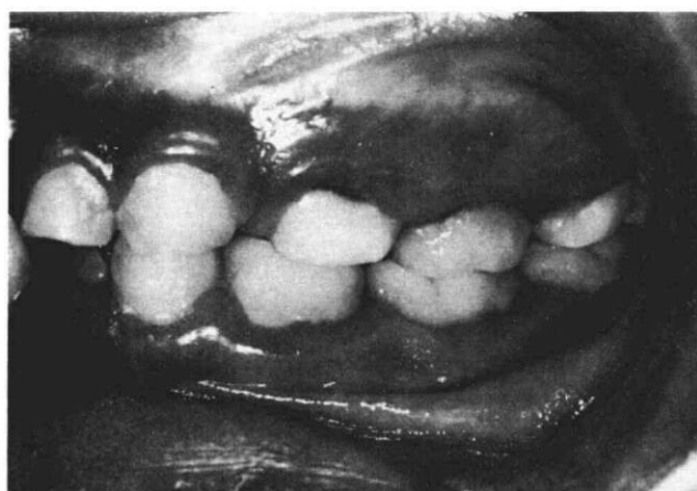
FIG 1. Clinical features of JP in the primary dentition showing grossly inflamed and swollen marginal and attached gingiva.

The child had an Angle Class I occlusion and tooth mobility was minimal except for the primary molars in the mandibular right quadrants.