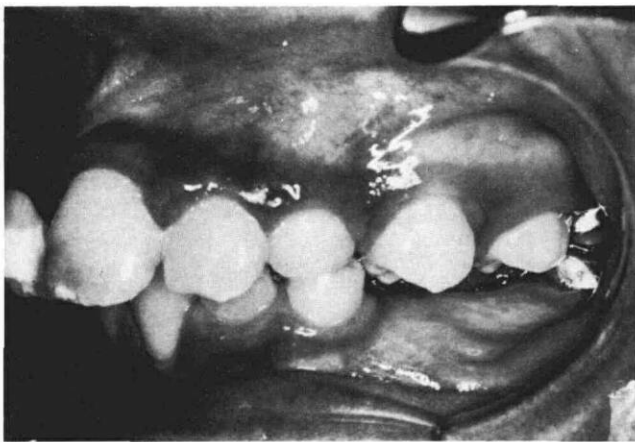
FIG 3. Clinical picture of the patient 2 and a half years post-treatment showing improved gingival health.

To follow the periodontal changes after treatment, clinical and radiographic examinations as well as plaque cultures and serum anti- Ha antibodies were performed at 6-month intervals for 2½ years. Results indicated normal pocket depths and absence of radiographic bone destruction in the permanent dentition. (Figs 3,4). Plaque culture revealed an absence of Ha .