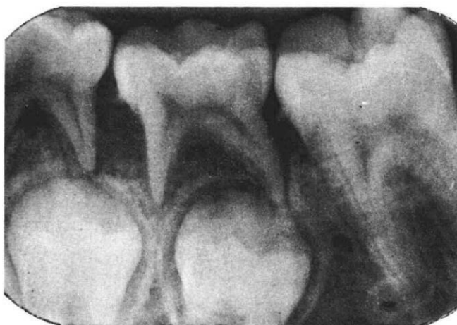
FIG 2. Radiographic features of JP in the primary dentition showing extensive alveolar bone loss with furcation involvement of primary molars.