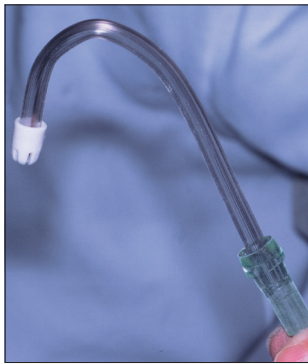
Fig 1. The saliva ejector attached to a standard oxygen hose and contoured for placement in the child's mouth

*Fishbaugh et al. Pediatr Dent. 1997;19:277-281