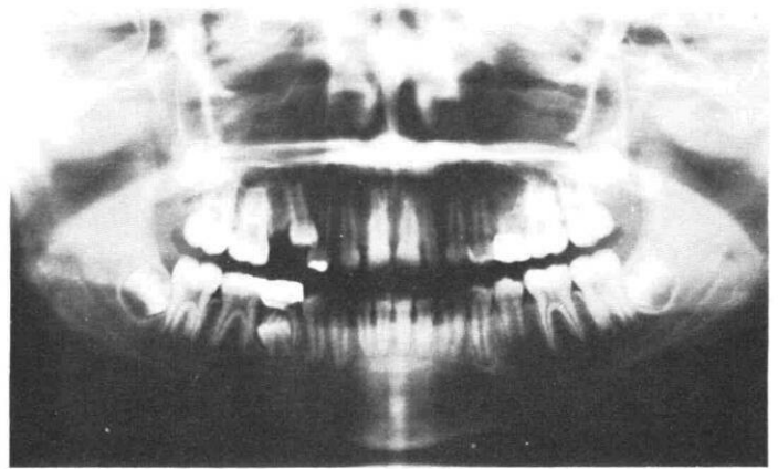
FIG 2. Panoramic radiograph at 11 years, 11 months.