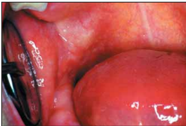
Fig 4. Spontaneous healing of wound in Fig 3, six weeks after injury. Note light color of healing site.

in their mouths. The child may then fall on the object or receive a direct force on the object which then perforates the soft palate tissue.