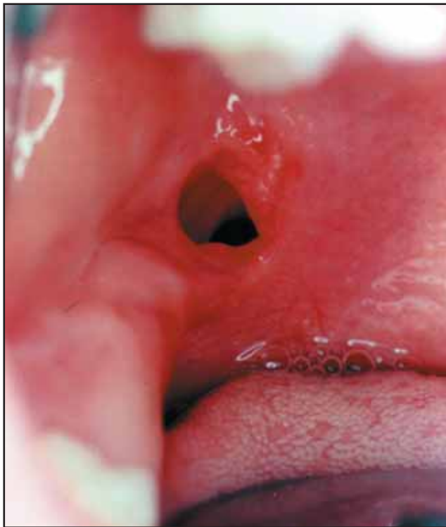
Fig 3. Impalement injury in a 5-year old male. The patient presented at a private practice two to three days following a fall with a pencil-like object in his mouth. No bleeding was observed by parent and the patient did not alert parent until present time. Prophylactic antibiotic therapy was initiated and parent was given detailed instructions.