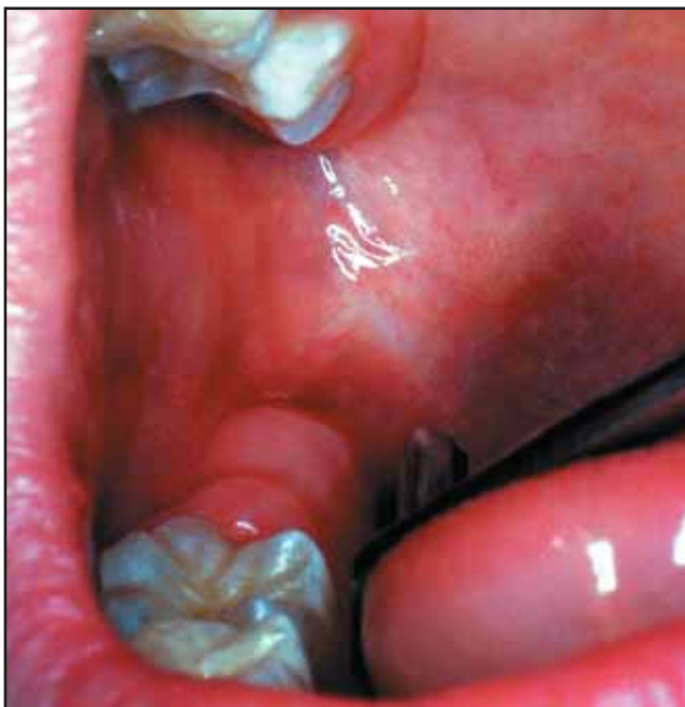
Fig 5. Ten months following injury, healing tissue has been replaced by healthy, normal-looking tissue.