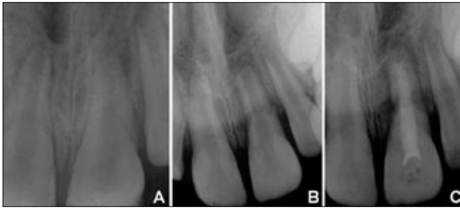
Figure 1a. Left maxillary central incisor replanted after an avulsion injury and stabilized with a fishing line splint. This periapical radiograph was taken 1½ hours after the injury was sustained.