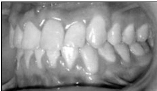
Figure 5. Appearance of the dentition following orthodontic treatment.