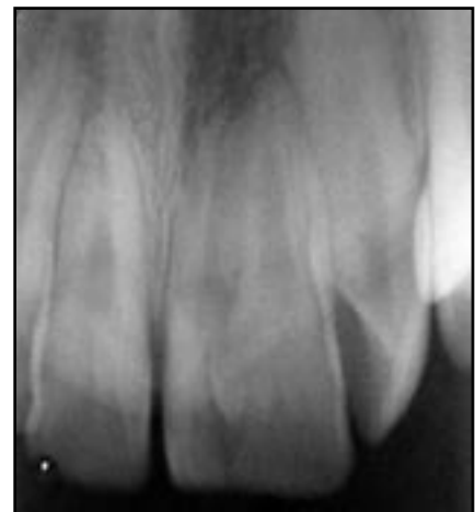
Figure 2b. Pretreatment periapical film of the central incisor fused to a supernumerary tooth.