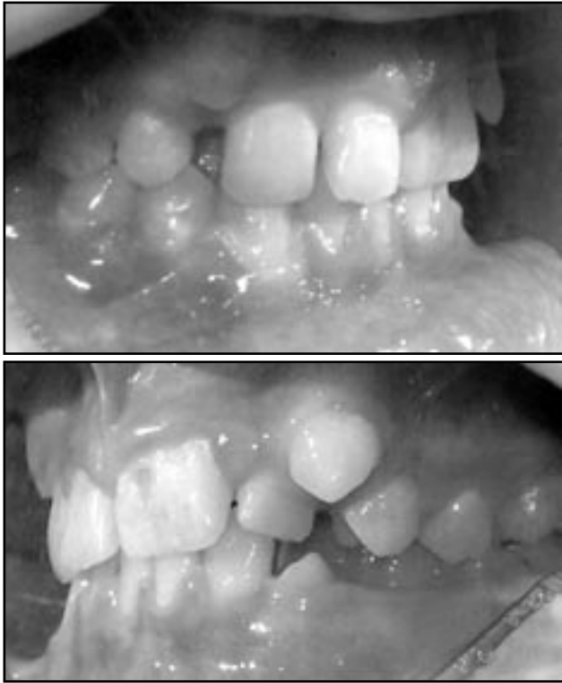
Figures 1a and 1b. Pretreatment photographs of a patient with a fused maxillary left central incisor, macrodont maxillary right lateral incisor, and crowding.

clusion is impossible in the presence of geminated, fused, or macrodont teeth. 14