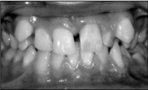
Figure 4. Maxillary teeth after surgical and restorative treatment.