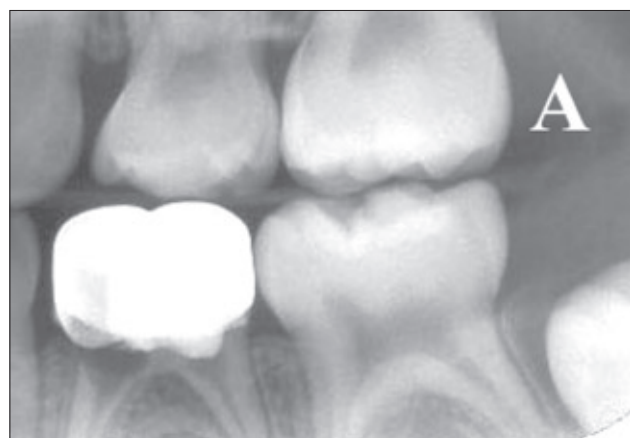
Figure 1A. Left bite-wing radiograph of a 5-year, 2-month-old girl. Primary mandibular first molar with internal resorption in the mesial root 7 months after performance of pulpotomy with formocresol.