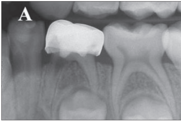
Figure 2A. Left bite-wing radiograph of an 8-year, 2-month-old girl. Primary mandibular first molar with internal resorption in the mesial root 38 months after performance of pulpotomy with MTA.