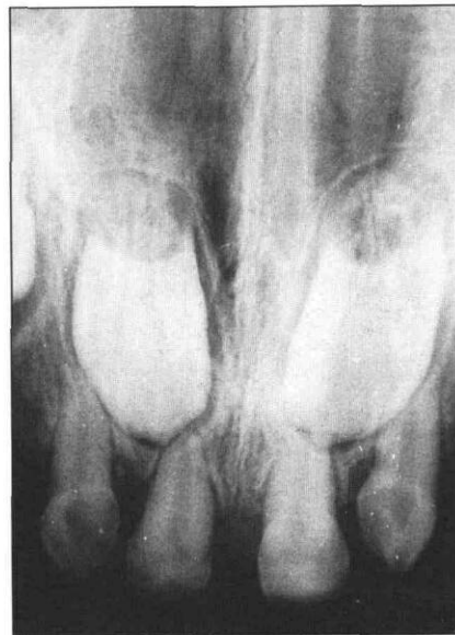
Fig 3. Periapical radiograph of the premaxilla of Case 2. Notice the missing permanent lateral incisors and the dens invaginatus in both teeth.

The major dental anomalies in the present case report were similar to those described by Robbins and Keene (1964), but the pattern of transmission in the family described here suggests an autosomal recessive condition. Both parents of the affected children and possibly other members of the family are heterozygote carriers of the condition. The fact that the parents are close relatives (first cousins once removed) increased the possibility that their children will be homozygotic and have syndromes.