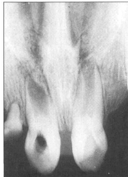
Fig 1. Periapical radiograph of the premaxilla region of Case 1. Notice the deep dens invaginatus in both incisors and the missing permanent lateral incisors.

canines and the mandibular first permanent molars were present, as were all of the primary molars, except for the mandibular left first molar. The four mandibular primary incisors and the maxillary right primary lateral incisor also were identified clinically. A panoramic radiograph (Fig 2) revealed that the erupted teeth were all that had