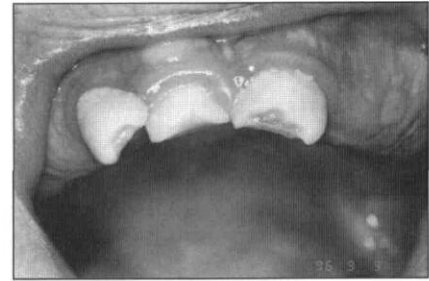
▶ Fig 2b. Maxillary teeth showing pitting and discoloration of the incisal edges.

teeth had erupted; the gum pads were normal in appearance but the maxillary pad was noted to be relatively large. By the age of 3-and-a-half the mandibular primary central incisors (71, 81) had erupted (Fig. 2a) and by 5 years the maxillary primary central incisors (51, 61) were present. The child is now 6 years old and the upper right primary lateral incisor (52) has also erupted (Fig 2b). The teeth are chalky white with pitting and brown discoloration of the incisal edges, particularly in the maxilla (Fig 2b); this suggests the possibility of an enamel defect. No treatment has yet been carried out and none is planned in the near future. Although the child appears to have developed normally, both physically and mentally, he is quite shy and reluctant to cope with dental examinations.