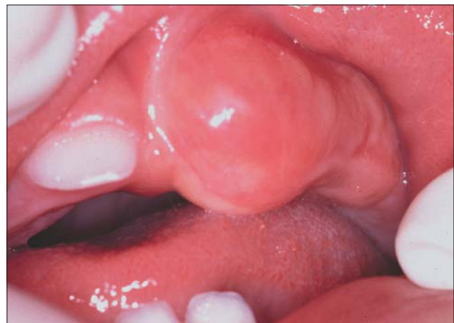
Fig 1. Gingival swelling associated with an unerupted maxillary central incisor

An 11-month-old Hispanic boy was referred by an emergency room physician for the management of a gingival abscess that had been increasing in size for one month. This healthy and normally developing infant was in the 75 th percentile for height and weight. The gingival swelling was described as being painful and was nonresponsive to amoxicillin. According to his parents, the lesion was beginning to interfere with eating and drinking. Furthermore, the child was constantly rubbing or hitting the gums with his toys, due to teething problems. Clinical examination revealed a 2X1.5-cm gingival enlargement of the anterior left maxillary alveolar mucosa, which was spongy to palpation