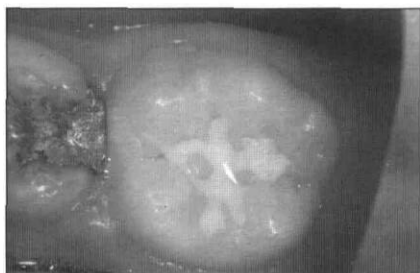
Fig 1. White sealant on a mandibular first molar. The buccal sealant and the bulk of the occlusal sealant are intact and "successful". Sealant loss has occurred leading to several supplemental grooves of the occlusal surface being exposed and stained. No primary groove is uncovered. No caries are detectable.

Short of frank caries development, there exists no strict definition of what constitutes a failed sealant. While the scientists may debate the issue, the clinician makes daily decisions on when to repair and when to