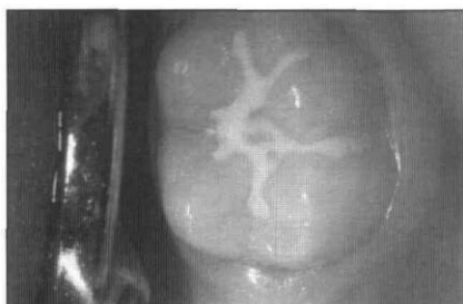
Fig 2. White sealant on a mandibular first molar. All aspects of this sealant are intact with the exception of the most lingual part of the lingual occlusal fissure. No caries are detectable.