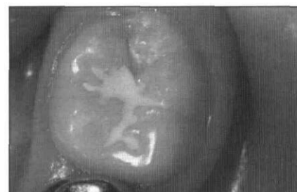
Fig 3. White sealant on a mandibular first molar. The distal one-third to one-half of this sealant has fractured and debonded. A major defect is present at the sealant-tooth margin and two primary grooves are uncovered.