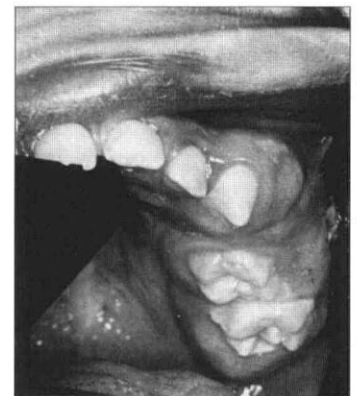
Fig 1. Intraoral photograph showing the left maxillary expansion, gingival thickening, and the depigmented area on the left upper lip.

Periapical and panoramic radiographs revealed an ill-defined, coarse, irregular trabecular bone pattern superimposed over the primary left maxillary molar roots and extending superiorly to the floor of the maxillary sinus (Fig 2). The sinus floor appeared elevated in contrast to the uninvolvement side. The primary molar root images were indistinct. It