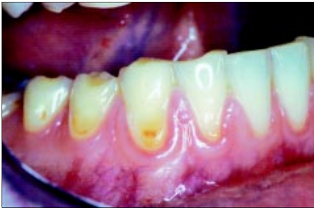
Fig 4. An example of attrition effecting the incisal/occlusal surfaces of these teeth. Please note there is probably an erosive and abrasive component to the tooth surface, as seen on the labial surfaces.

available is for adults reporting a prevalence of approximately 25% of teeth examined to have evidence of erosion, however this paper actually examined the prevalence of cervical abrasion cavities rather than true erosion. 7 Anecdotally, it has been suggested that erosion is far less common in children and adolescents in the US than the UK. The differences may be real or may reflect differences in awareness of the condition. The 1993 UK Survey of Child Dental Health in the United Kingdom, the first UK survey to assess erosion on a National basis, reported 27% of 12-year-old children to have erosion of the upper incisors of the palatal surface. 8 Erosion is thought to have a multi-factorial aetiology including host and environmental factors. The principal causes of erosion are presented in Table 1. 9-11