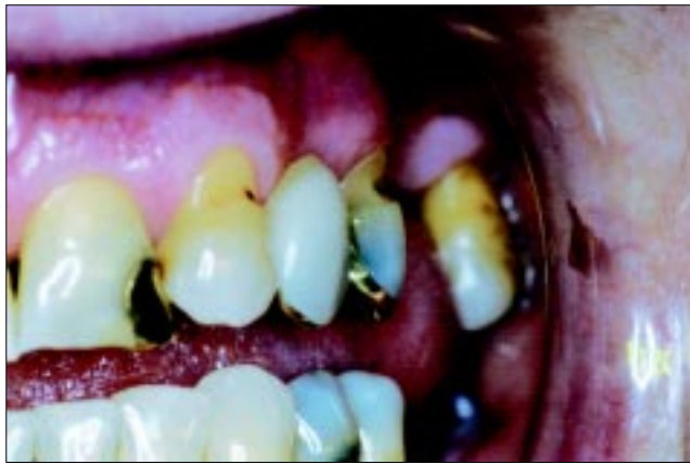
Fig 3. An example of abrasion at the cervical region of these teeth.