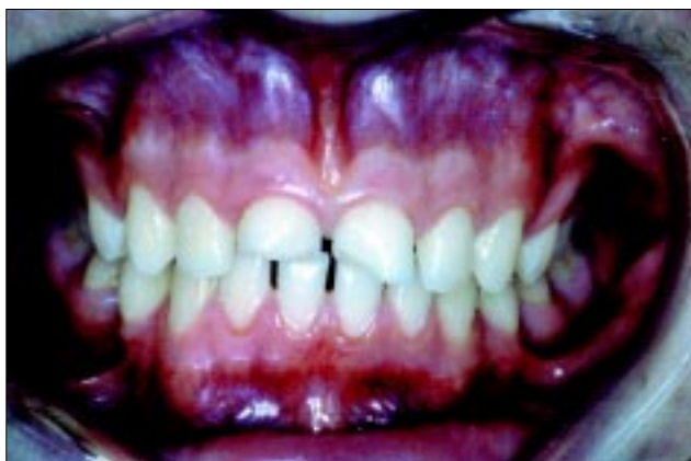
Fig 2. An example of erosion of the buccal surfaces of the upper permanent incisors (same subject as Fig 1).

3 and 4 present examples of abrasion and attrition, respectively, for comparison.