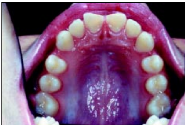
Fig 1. An example of erosion of the palatal surfaces of the upper permanent incisors.

Tooth surface loss or tooth wear can arise as a result of erosion, abrasion, and attrition. 1 Erosion is the loss of dental hard tissue by a chemical process, which does not involve bacteria. 2 Abrasion is the pathological wearing away of tooth substance by a foreign body independent of occlusion. Attrition is the loss of tooth substance as a result of tooth to tooth contact. Accepting that these processes are not seen in isolation, history and clinical appearance can lead to the identification of the predominant etiological cause of tooth surface loss. 1,3,4 Teeth affected by erosion become rounded, lose their surface characterisation, and any restorations present become proud. Once dentine is exposed, "cupping" or "lesions" on occlusal surfaces may be seen. Figures 1 and 2 present an example of erosion of the upper permanent incisors in a 12-year-old British boy. In the case of attrition, wear will occur evenly and only on surfaces in tooth to tooth contact. Figures