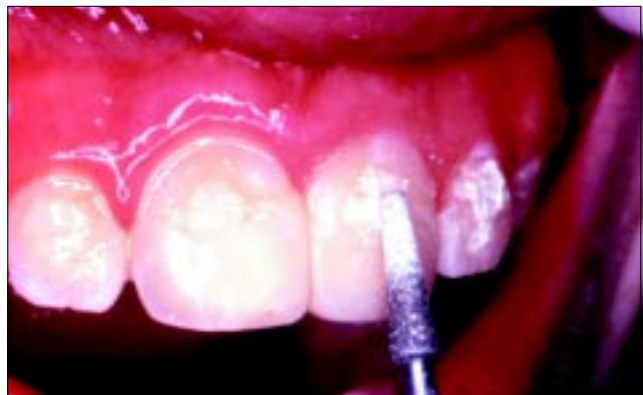
Fig 9. Diamond bur at slow speed used to remove bonded compomer material. Polishing disks then used to finish enamel surface.