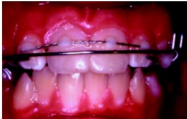
Fig 8. Splint observed 8 days after application. Wire and compomer placement designed to avoid interference with orthodontic retaining appliance.