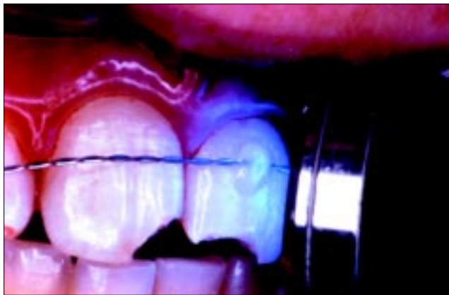
Fig 3. Small increment of compomer material attaches twisted double strand of 0.010" ligature wire to tooth surface at about one-third coronal height