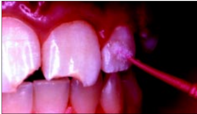
Fig 2. Self-etching adhesive bonding agent applied to the left incisors, and light-cured, after tooth surfaces cleaned