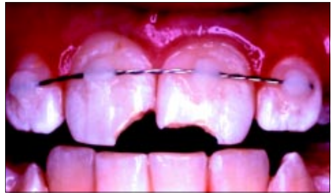
Fig 5. Completed bonded compomer/wire stabilization splint