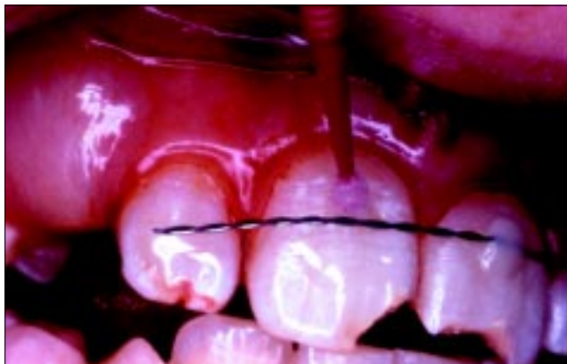
Fig 4. Ligature wire attached to right central and lateral incisors