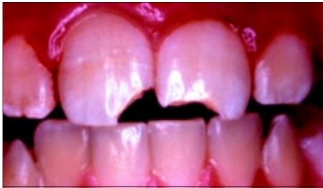
Fig 1. All four maxillary incisors loosened by traumatic blow. Central incisors suffered enamel and dentin fractures of mesio-incisal corners.