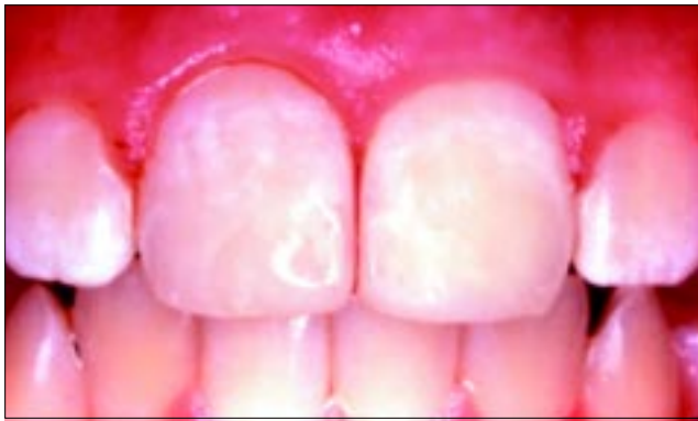
Fig 10. Incisors with interim restorations shown immediately after splint removal

after applying phosphoric acid to etch the enamel, the etched surface is rinsed and dried. Oftentimes, when splinting teeth after traumatic displacement, there exists hemorrhage in the region which, once controlled, can resume with water spray lavage of the etchant solution. In addition, water spray and the sound of high-speed evacuation can be upsetting for some younger patients. Use of self-etching adhesive bonding agent makes splint application easier and faster by eliminating the separate etching and rinsing steps.