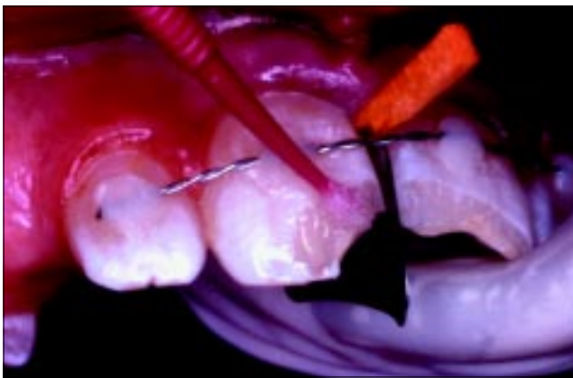
Fig 6. Self-etching adhesive, resin-based composite and matrix strip used to restore fractured incisors. Wooden wedge placed with minimal pressure.