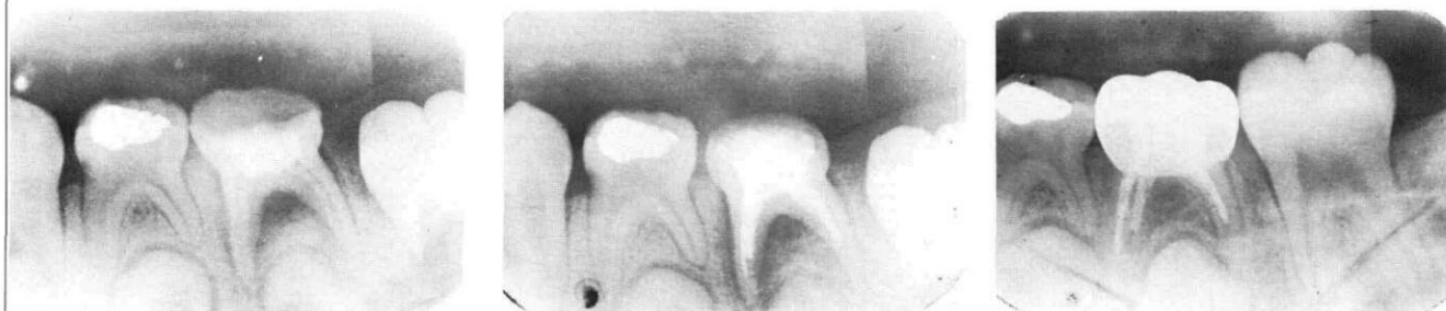
FIG 2. An example of typical bone fill in a successful pulpectomy. The tooth previously had a pulpotomy which had failed. A. (left) Preoperative film, patient age 5 years; B. (center) Immediate postoperative film; C. (right) 8 months postoperative film showing bone fill.