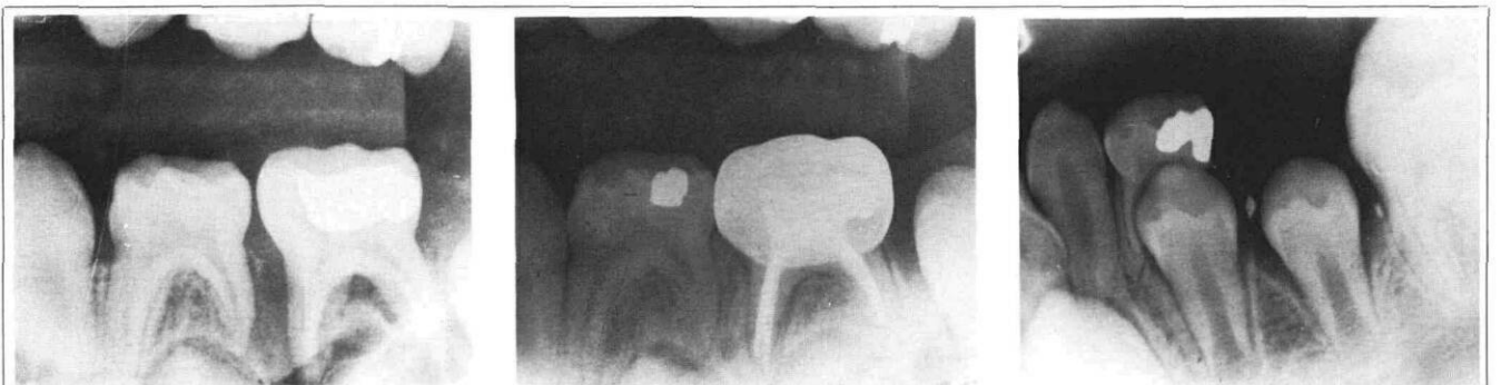
FIG 4. An example of a case wherein the ZOE root canal filler was retained in the gingival sulcus: A. (left) Preoperative film, patient age 5 years; B. (center) 8 months postoperative film, pulpectomy judged successful; C. (right) 5 years, 4 months postoperative film immediately after exfoliation. Note two pieces of ZOE. Premolar erupted without hypoplastic enamel defects.

technique is a viable alternative to extraction and space maintenance. The finding contradicts arguments previously noted that pulpectomies were time consuming, difficult to accomplish, or had questionable success. 1-3 If a pulpectomy failed, it usually showed clinical or radiographic signs of failure in 6 months or less.