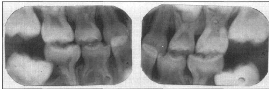
Fig 2. Bite-wing radiographs at age 7 years. Note the distal root resorption of both mandibular second primary molars.

The treatment plan for this patient consisted of hemisection of both mandibular second primary molars to allow vertical eruption of mandibular first permanent molars without further loss of arch circumference. Maintenance of arch circumference would be afforded by the remaining half of each mandibular second primary molar.