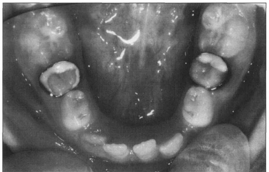
Fig 3. Photograph of mandibular arch 10 months post treatment showing hemisected primary molars with bands and showing successful eruption of first permanent molars.

Four months after treatment, the mandibular first permanent molars emerged. Since the mesial half of