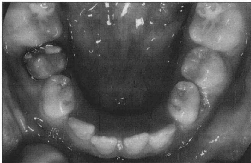
Fig 5. Photograph of mandibular arch 3 years post treatment.