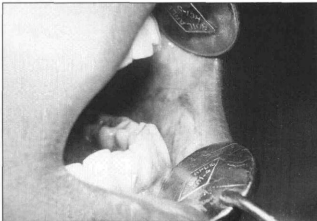
Fig 1. Restricted mouth opening and the blanched appearance of buccal mucosa.

The interincisal distance of maximal mouth opening was 1.7 cm. The oral mucosa appeared very pale. On