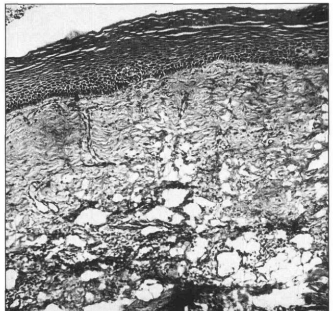
Fig 3. Oral submucositis fibrosis — histopathologic appearance of buccal mucosa showing atrophic epithelium and hyalinized lamina propria — H&E stain (original magnification, 100x).

The role of areca nut as an etiologic factor in OSMF has gained attention during recent years. 19,25 The frequency of areca nut chewing habit reported ranges from 84 to 100% in OSMF cases. 17,18 Sinor et al., 18 in a case control study, demonstrated that this condition occurred only among those who chewed areca nuts in one form or other.