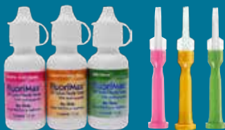
FluoriMax® Fluoride Varnish

Bubble Gum, Salted Caramel and Mint As Low As 16¢ Per Use