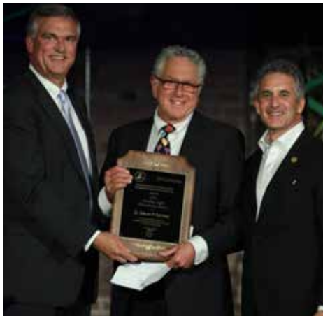
ann page griffin humanitarian award

Sponsored by Baylor Pediatric Alumni Fund