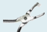
Band Removing Plier