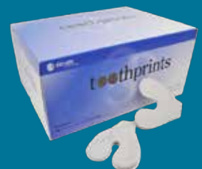
Toothprints Dental ID Kit

Pump a Pea or Rice-sized Dose for Protection