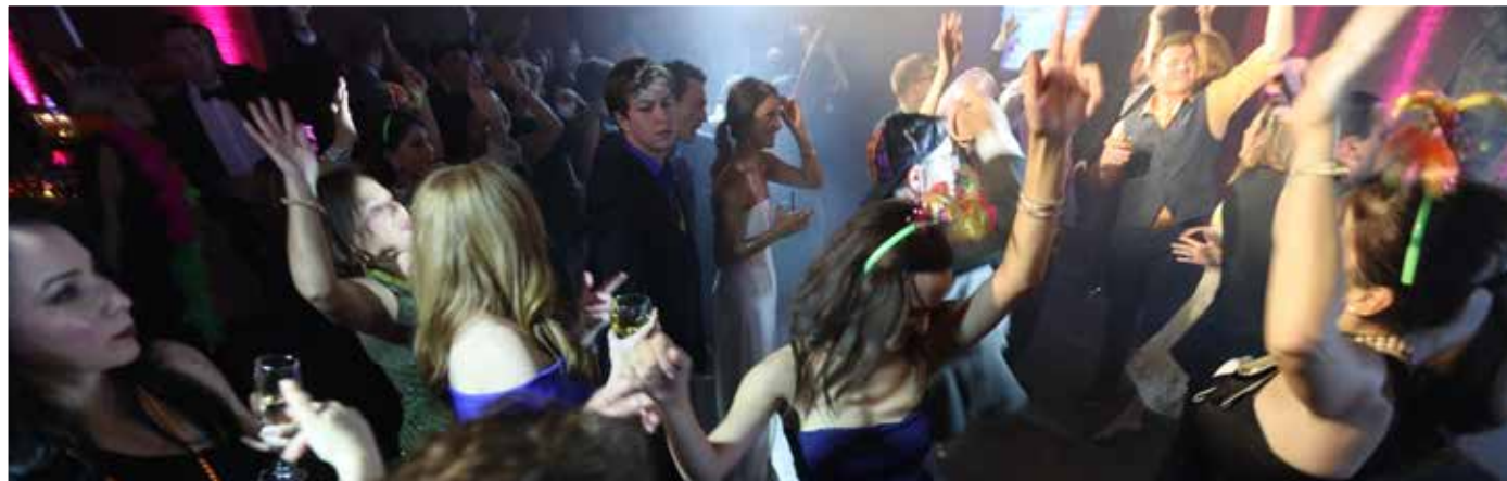
Reception sponsored by Treloar & Heisel