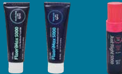
FluoriMax™ 5000 and Just Right® 5000 Prescription Toothpaste

Bubble Gum, Salted Caramel and Mint As Low As 16¢ Per Use